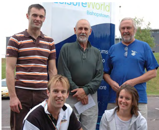
Best Overseas Visiting Team – Cork 2007