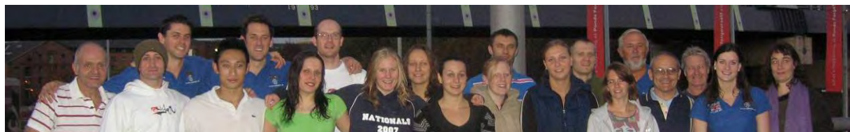
Otters at the Short Course National Championships, Sheffield