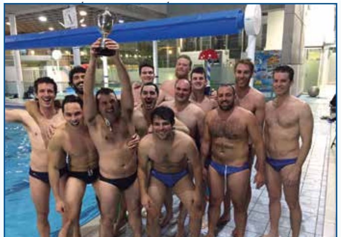
Thameside Water Polo Association cup winners

In May we played the final of the Thameside Water Polo Association's handicap knock-out cup competition against Poly, at their home venue of the Clissold Leisure centre. Knowing that Poly would field a strong side, we put out a strong mix that combined 1st and 2nd team experience. As usual with Poly the game was friendly but robust and played to a very high standard throughout. The final score after handicap adjustment was 14 apiece. Otter were declared the