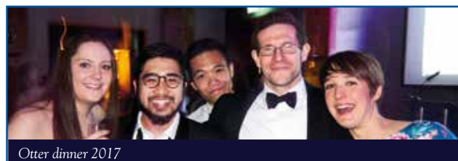
Otter dinner 2017