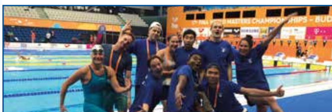
Team Otter in Budapest

From Friday 11th to Sunday 20th August, Budapest and Balatonfüred welcomed the arrival of 9,283 athletes, of which 6,524 were swimmers, and 1,239 open water entrants for the 17th FINA World Masters Championships. Four competition pools were required to accommodate these numbers over the five day competition; two in the brand new Duna arena and two in the outdoor Alfréd Hajós national swimming complex. Team Otter contributed a total of 24 athletes to the mix and achieved some great results.