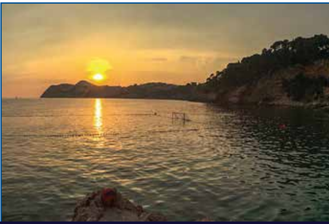
Dance beach, Dubrovnik, where water polo was first played in the city