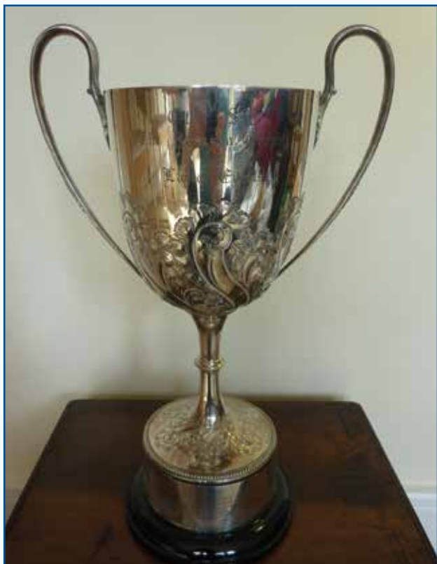
The Jackson Trophy

The 2017 Club Championship events include the Mile open water and nine pool events, which were held over three Thursdays in November at the QMSC pool. In total 33 men and 16 women competed.