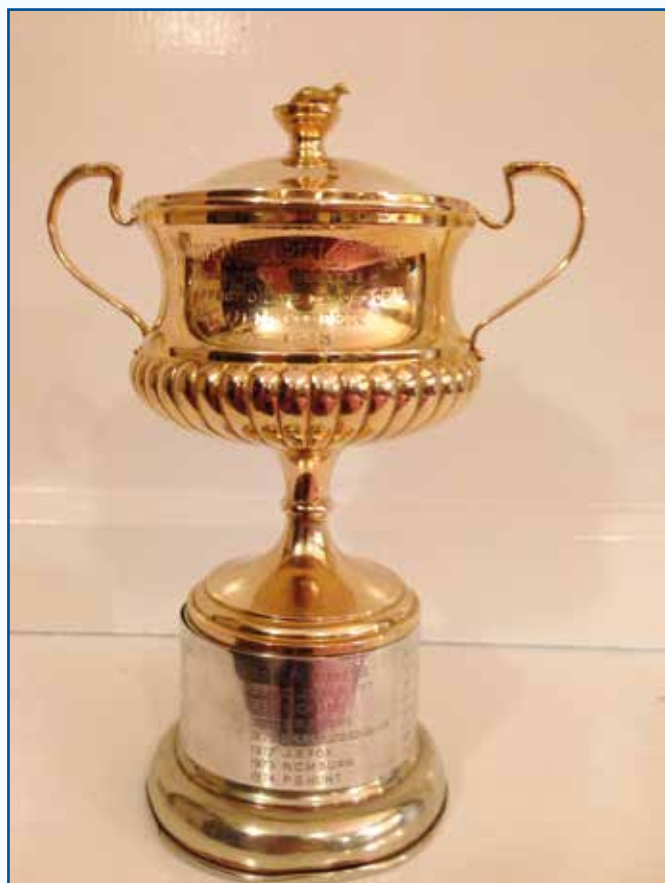
The JW Rope Trophy