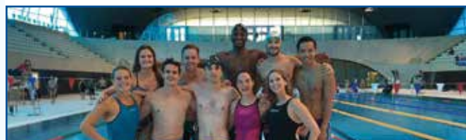
Otter at GLAMM

10 Otters present had a spot in the team, several of whom were still breathing heavily and full of lactic acid from just completing the 100m breast! After an exciting performance and a solid effort, Otter finished in a close second place behind their friends at LUST (London Universities Swim Team). There's always next year..