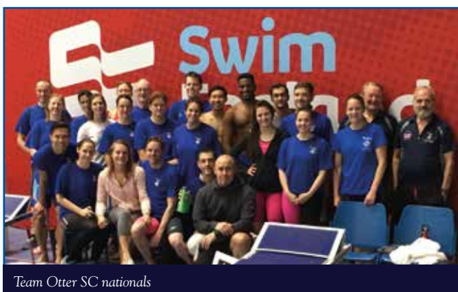
Team Otter SC nationals

The competition was tough. I was the only Kiwi in my heats. Beaten by truly international competitors from Canada, Switzerland France, Russia etc.