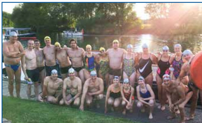
Otter swimmers prepare for the Half Mile