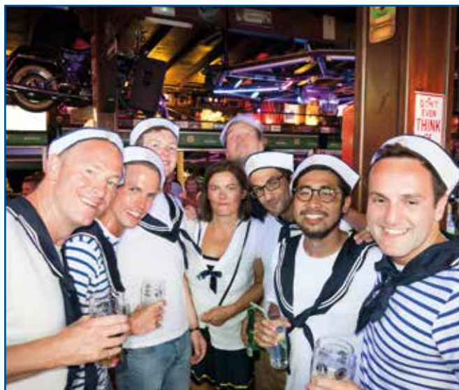
Otters enjoying the delights of Puerto del Carmen