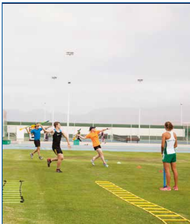
Otters try their hand at javelin, with varying degrees of success!