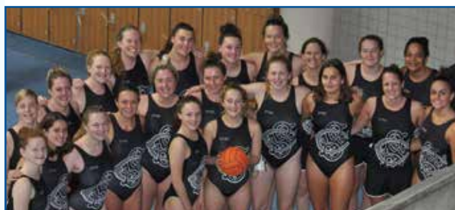
Otter and Lutra 2017/18 BWPL teams