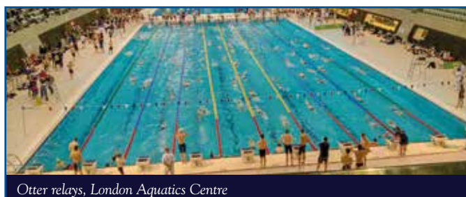
Otter relays, London Aquatics Centre