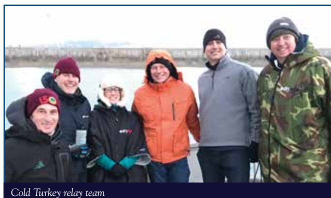
Cold Turkey relay team

It was a relay with a difference - a challenge but immensely fun. I wouldn't do it again but I am very glad to have done it! Team Cold Turkey (6) saw from England to France on 2 December 2017 in a time of 13 hours and 18 minutes. It was cold.