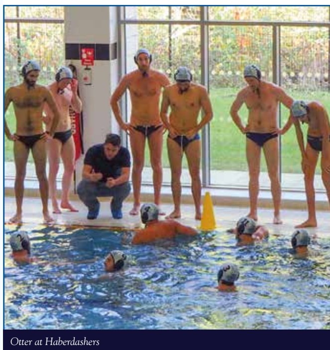
Otter at Haberdashers

hunger for victory. The team walked away from phase 1 of the season with their heads held high. Their friendliness and optimism brought praise from a number of teams and officials. And their dancing prowess continues to have no match in Grantham, if not further afield. Maybe it's this very reason why no other team in the league has yet to accept a dance off challenge from our fabulous fantasists.